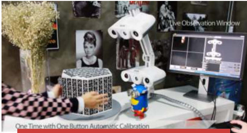
One Time with One Button Automatic Calibration