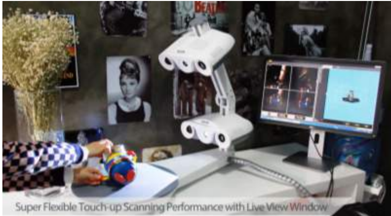
Flexible Touch-Up Scanning With Live Window